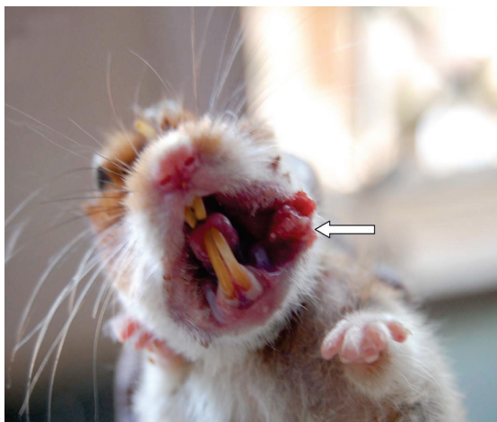
Fig. 1 Photograph shows the gross appearance of oral squamous cell carcinoma ( ← ) noticed in DMBA-alone painted animals.