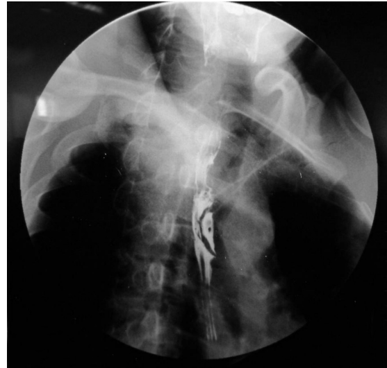
Fig. 1 Barium swallow shows an eccentric filling defect in the oesophagus at T2–T3 and T3–T4 levels.

A 37-year-old man presented to the ENT outpatient department of Lok Nayak Hospital with complaints of difficulty in swallowing for the past 2–3 days. On investigating his past history, it was revealed that the patient had suffered from similar acute onset complaints six months ago and was investigated, but nothing was found conclusively and therefore, the patient was kept on conservative management. The patient gradually recovered from his complaints within a week and was well until a few days prior to presentation when the symptoms recurred. There was no associated history of weight loss nor was there a history of respiratory distress, chest pain, (1) fever, vomiting or dark-coloured