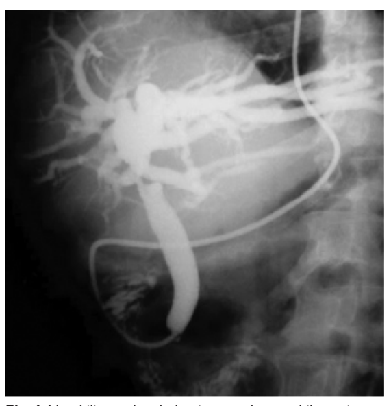
Fig. I Nasobiliary tube cholangiogram shows a hilar stricture, dilated common bile duct with shouldering distally.

A 67-year-old man presented with a two-month history of pruritus, increasing jaundice and pale-coloured stool. His past medical history included diabetes mellitus, hypertension and previously-treated pyogenic liver abscess secondary to Klebsiella penumoniae in 1996. The patient had been well until seven months before the current presentation when he was admitted under the orthopaedic service for an increasing right ankle swelling and deformity, suspected to be infective in