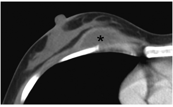
Fig. 4 CT image of the thorax shows a hypodense collection in the right chest wall (asterisk), corresponding to the fluid collection seen on US.

lobes and in the superior segment of the right lower lobe. Ultrasound-guided 14-gauge core needle biopsy was performed and this revealed necrotising granulomatous inflammatory tissue with rare acid-fast bacilli, consistent with a tuberculous infection.