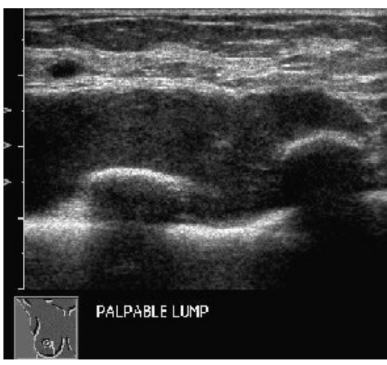
Fig. 2 US image of the right breast shows an elliptical hypoechoeic collection deep in the right mammary layer in the lower inner quadrant of the right breast.