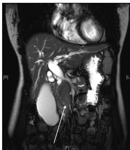
Fig. 1 Coronal fat-suppressed T2-W MR image of the abdomen shows a tumour in the head and uncinate process (arrow) causing compression and displacement with possible invasion of the portal vein.

A 52-year-old Chinese woman presented with a history of malaise, progressive jaundice and tea-coloured