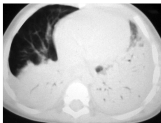
Fig. 2 CT image of the thorax shows consolidation of the lung, predominantly in the gravity-dependent areas.

of Medicine, Balcali Hospital, Turkey. He had cough, and gradually increased respiratory failure occurred following accidental ingestion of cleaning naphtha. His past medical history was unremarkable. At the time of admission, he had been found unconscious with tachypnoea (40/min) and cyanosis. Due to the severity of the respiratory failure, the patient was immediately intubated and transferred to the Paediatric Intensive Care Unit (PICU). At admission, his body temperature was 37.5°C, heart rate 183/min and blood pressure 80/40 mmHg. Lung examination revealed coarse breath sounds with inspiratory and expiratory crackles throughout, and no wheezing. His cardiac examination was normal except