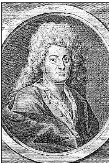
Fig. 1 Drawing of Pierre Dionis (1643–1718).

It has been said that the developments of the 16th century served as the stimulus for the scientific revolution that gave birth to spectacular progress during the 19th and 20th centuries. During the late Renaissance period of the 16th century, the renowned French surgeon Ambroise Pare played an enormous role in helping surgery regain the status it had lost during the Middle Ages. 17th century surgeons struggled to achieve recognition and autonomy, which served to fuel the hostility of physicians and barbers toward surgeons. Since the Middle Ages, barbers had not only cut hair, they also performed surgery. The surgeons of the 17th century no longer trimmed beards, but instead focused on their own academic advancement. Concurrently, the late 17th and early 18th centuries, in particular, were characterised by fantastic achievements in anatomy and surgery. During this time, France led Europe in such advancements, thanks, in part, to the work of Pierre Dionis (1643–1718) (Fig. 1). He was the first in a line of surgeons in Europe that became celebrated for their surgical skills and academic knowledge during the 18th century. Despite their proven skills and expertise, it was not until the end of the 18th century that surgeons were seen as being equal to physicians.