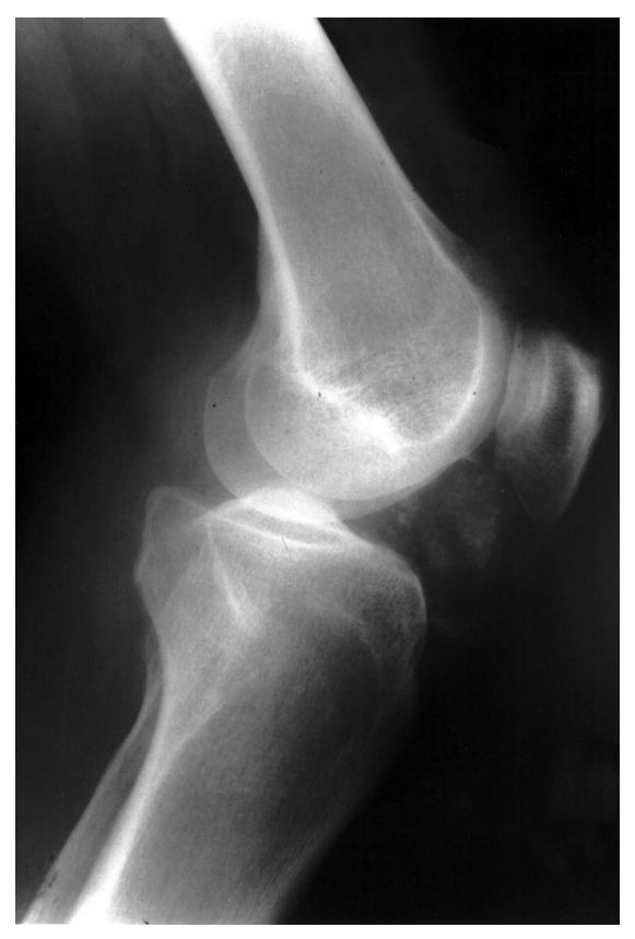
\mbox{\bf Fig. I} Lateral radiograph of the knee shows calcification in Hoffa's fat pad.

A 55-year-old male builder presented with a history of progressively worsening knee pain for one year. The pain was especially severe while climbing stairs and lifting