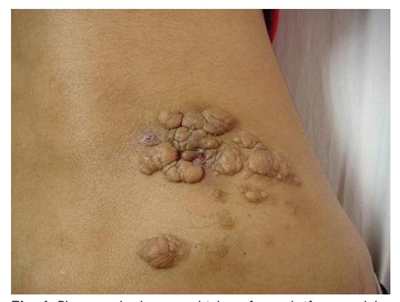
Fig. I Photograph shows multiple soft cerebriform nodules coalescing to form the main lesion, with two small ulcers on the right lower back. Multiple satellite nodules and papules were noted.

On examination, she was a healthy, thin woman. There were multiple skin-coloured, non-tender, soft, compressible cerebriform nodules coalescing into a plaque, and forming the main lesion in an area measuring 8 cm \times 5 cm on the right lower back. There were also multiple satellite papules and nodules measuring 0.5–3