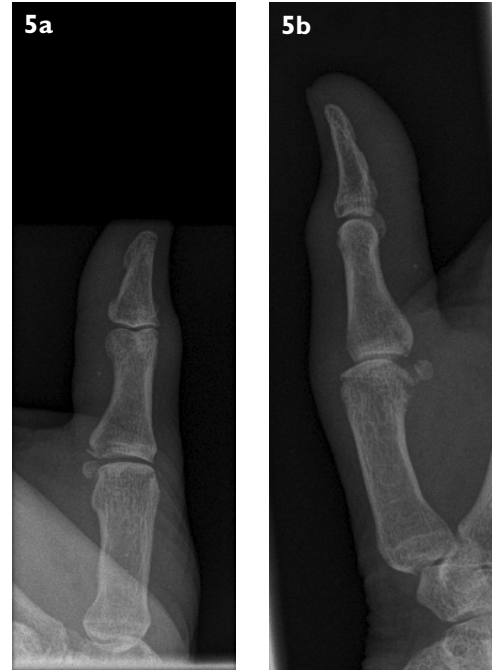
Fig. 5 (a) Anteroposterior and (b) lateral radiographs of the right thumb show well-aligned metacarpophalangeal and interphalangeal joints at six weeks' follow-up, with no associated complications.

day, with a thumb spica for three weeks. The patient was referred for hand therapy after three weeks. At six months' follow-up, he had regained a full, painless range of movement in his thumb with no signs of instability (Fig. 5).