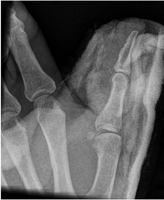
Fig. 4 Post-reduction radiograph shows the anatomical reduction of both joints.