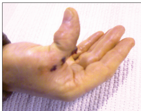
Fig. 1 Photograph shows open dislocation of the metacarpophalangeal and interphalangeal joints of the right thumb, resulting in gross deformity.

Dislocation involving two adjacent joints in the same finger is a rare injury. (1) Open double dislocation of the thumb involving the metacarpophalangeal joint (MCPJ) and interphalangeal joint (IPJ) fortunately remains an extremely uncommon entity. Nevertheless, whenever encountered, this rare injury poses a special challenge to a hand surgeon in terms of both management as well