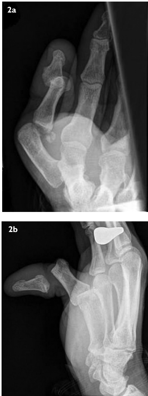
Fig. 2 Anteroposterior and lateral radiographs show the characteristic injury pattern, with volar and dorsal dislocations of the (a) metacarpophalangeal joint, and (b) interphalangeal joint.

the injured thumb. However, despite the severity of the injury, the distal neurovascular status was intact. An urgent radiograph revealed a unique pattern of injury. Both the MCPJ and IPJ were dislocated to the volar and dorsal side, respectively, along with an associated injury to the ulnar collateral ligament (Fig. 2). Due to the complexity of the injury, the case was discussed with the consultant orthopaedic surgeon on call. Owing to the non-availability of an emergency theatre and to avoid further delay, a decision was taken to attempt a close reduction in the casualty ward, with a thorough wound toilet.