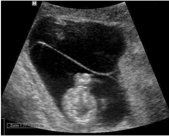
Fig. 2 US image at 12 weeks shows no apparent twin peak sign, suggesting monochorionicity.