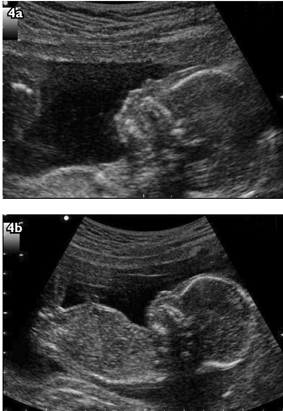
Fig. 4 US images of (a) twin A, and (b) twin B, each with an absent nasal bone identified at 19 weeks' gestation.

of DS in twins in general comes from cohort studies carried out during routine FTS at 11–14 weeks. For example, one of the few cohort studies conducted by Vandecruys et al determined the incidence of MC twins with DS to be 0.8%. (9) Some authors feel that the DS incidence in MC twin pregnancies should be comparable to that in singleton pregnancies as MC twins similarly arise from a single fertilised egg. (7) In contrast, for DC twin pregnancies, given that each twin has the same DS risk as a singleton, the theoretical risk of at least one foetus having a chromosome defect is about twice that in singleton pregnancies. Moreover, given that both the risks of chromosomal abnormality and dizygotic twinning increase with maternal age, it is likely that the risk of chromosomal defects in DC pregnancies is more than twice that in singleton pregnancies.