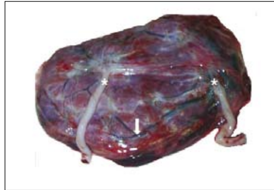
Fig. 5 At post-delivery examination of the placenta, photograph shows the placenta with vascular anastomoses (white arrow) between the two cord insertions (*), confirming a monochorionic twin pregnancy.

In the first trimester, chorionicity can be easily and accurately determined. The presence of a twin peak sign or separate placentas accurately diagnoses DC. However, as the pregnancy progresses on to the second trimester (as in our case), separate placental masses of a DC twin pregnancy may fuse together, giving the appearance of a single placental mass. Also, the intertwin septum thins as gestational age advances, thus reducing the reliability of chorionicity determination through the determination of the septal thickness. Moreover, any absence of twin