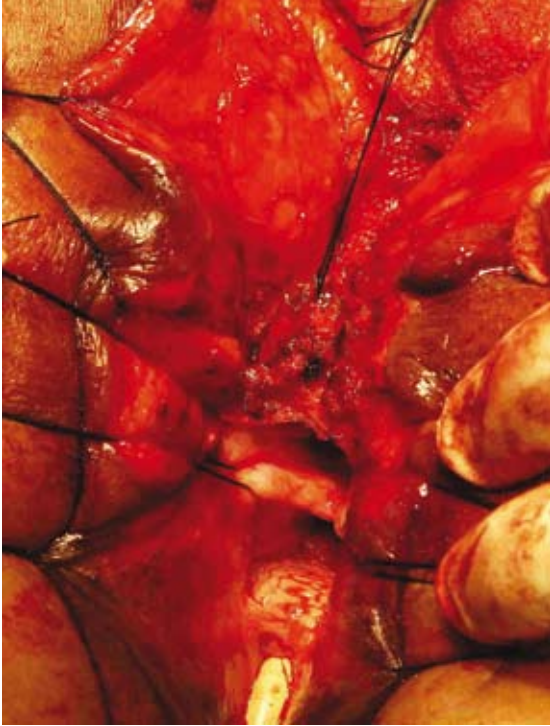
Fig. 2 Case 1. Intraoperative photograph shows the separation of the vagina and rectum.

with abdominal pain, distension and vomiting. On taking a detailed history, it was found that she had been suffering from an anorectal malformation since birth, and passing stools per vagina. She underwent a transverse colostomy as only a diversion could ameliorate her symptoms. However, her distal loop was loaded with hard, scybalous stool which was softened with regular use of liquid paraffin. Meanwhile, she underwent a complete work-up to define the extent of her anorectal malformation. A distal cologram was done which showed a low rectovaginal fistula with two openings (Fig. 1a). She had a fully developed sacrum, a normal gluteal cleft, and no other congenital abnormality.