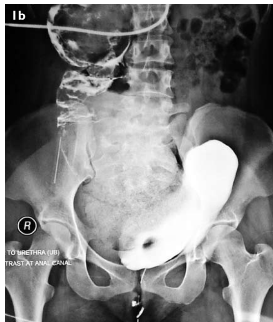
Fig. 1 (a) Case 1. Distal cologram in the female patient shows a hugely distended colon (pouch colon) with dye escaping from the vagina, confirming a low rectovaginal fistula. (b) Case 2. Distal cologram in the male patient shows contrast in the rectum and entering the urethra, confirming a rectourethral fistula.