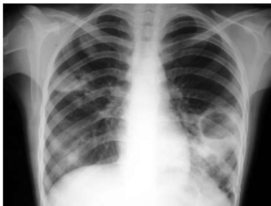
Fig. 1 Chest radiograph shows a thick-walled lung abscess with an air cavity in the lower left zone.

Non-typhoidal salmonellosis (NTS) is a common cause of self-limited diarrhoea in healthy children. The responsible organisms may, at times, become invasive with resultant bacteraemia and focal infections. (1) Although it is more commonly seen in immunocompromised and chronically-ill children, it may be observed rarely in otherwise healthy, immunocompetent ones. The aim of this letter was to report an 11-year-old immunocompetent girl with Salmonella ( S. ) group B spp. lung abscess and thrombocytopenia, resulting in skin and subconjunctival bleed during the course of her infection. This otherwise healthy Hindu Bengali girl, born to non-consanguineous parents, presented with complaints of fever and productive cough, with respiration difficulty of one-month duration. She had associated loose stools which commenced five days prior to the onset, and lasted for ten days. The stools were not accompanied by mucus or blood. Vomiting and painful defaecation were absent. Prior to admission, the girl had received oral amoxicillin 30 mg/kg/day for five days from a local general practitioner, but there was no improvement in her condition. She had become progressively septic with increasing anorexia over the last three days.