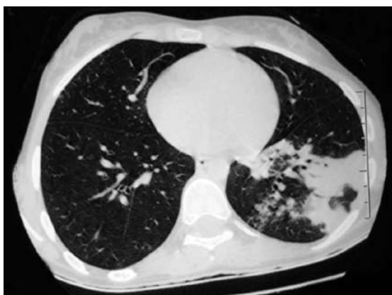
Fig. 2 High-resolution CT image shows areas of consolidation with an air cavity in the left lower lobe.