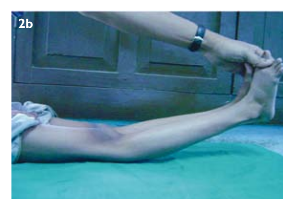
Fig. 2 Photographs show the patient's (a) hypermobile thumb, and (b) hypermobile knee joints.

since his childhood. The patient has three brothers and three sisters, and he was the second child. All his siblings were apparently normal. There was no history of consanguineous marriage. His mother had taken antituberculous drugs during her second pregnancy (no