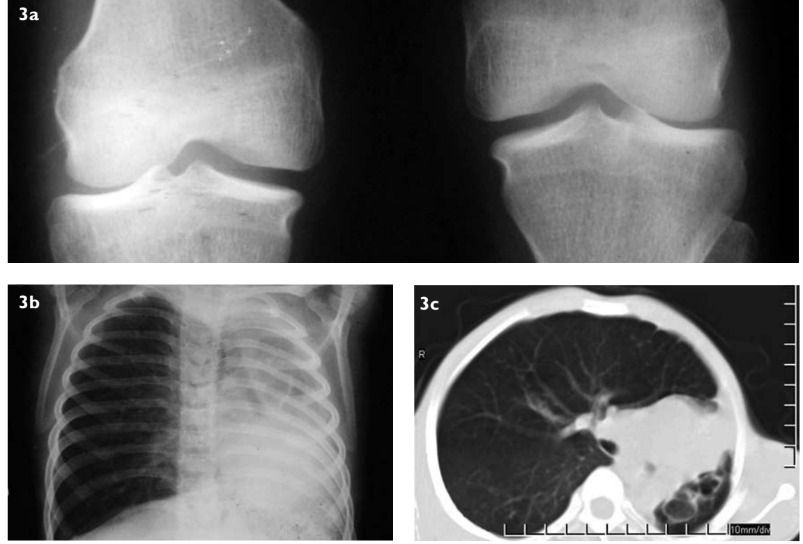
Fig.3 (a) Radiograph of both knees shows the absence of patella bilaterally. (b) Chest radiograph shows obvious left lung opacification, hyperinflation of the right lung and shifting of the mediastinum to the left side. (c) Axial CT image of the thorax shows a small hypoplastic left lung, with a small narrow left bronchus without any further branching.