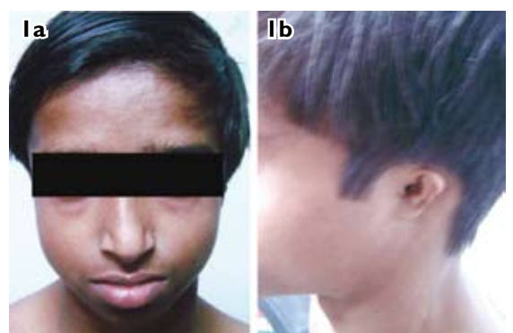
Fig. I Photographs show the (a) dysmorphic face, and (b) ears of the 22-year-old patient.

A 22-year-old male patient was admitted to the Department of Chest Medicine, Kolkata, India, with severe cough associated with purulent expectoration, left-sided chest pain and breathlessness of about one week's duration. There was a history of chronic cough, occasional chest pain as well as dyspnoea on exertion