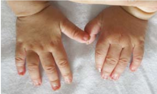
Fig. 2 Photograph shows clinodactyly (inward curving) of the fifth fingers and maldevelopment of nails in both hands.

evidence of any specific metabolic disorder was found in the urinary gas chromatography-mass spectrometry analysis and the tandem mass spectrometry analysis of blood spots. The infant had earlier been diagnosed with motor developmental delay, but no specific treatment was initiated. He was then transferred to our hospital for advanced investigation because of his significant motor developmental delay. At ten months, he was still unable to crawl, sit unsupported, stand independently or grasp actively with the palmar grip. He had been sweating excessively since four months of age, often wetting his shirt and bedsheets at night. His urine was normal, but the faeces were often hard.