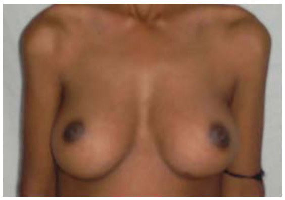
Fig. 1 Photograph of the patient on presentation shows Tanner Stage 5 bilateral gynaecomastia.

Klinefelter's syndrome is a common condition seen in approximately one in 500 to one in 1,000 male births. Most cases are inconspicuous before puberty. The postpubertal syndrome is characterised by small testes, with the testicular volume ranging from 1–4 ml. Men with Klinefelter's syndrome tend to be tall and have eunuchoid body proportions due to androgen deficiency, which leads to unfused epiphyses and the presence of three pseudoautosomal short stature homeobox genes (one in each X chromosome and one in the Y chromosome). Apart from having a tall stature, most of them have gynaecomastia (bilateral and usually painless) due to androgen deficiency and excessive aromatase activity. They also have problems with language and learning.