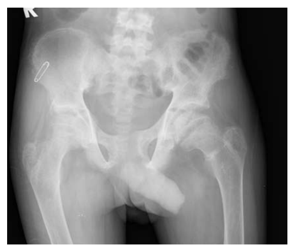
Fig. 2 Radiograph of the pelvis shows triradiate pelvis.

consanguineous marriage and had normal siblings. There was a history of delay in developmental milestones. He also gave a history of polyuria and polydipsia, but no history of renal stones, bone fracture, periodic paralysis or eye symptoms.