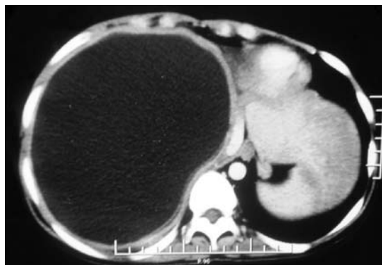
Fig. 1 Contrast-enhanced axial CT image of the abdomen shows a large hypodense lesion involving almost the whole of the right lobe of the liver and abutting the right hemidiaphragm. The cyst wall and its contents are non-enhancing.

A 17-year-old Indian girl presented with constant, dull aching and non-colicky pain, radiating to the right shoulder for the last three months. The pain was not associated with any aggravating or relieving factors, and there was no history of fever, jaundice or loss of appetite and weight. The patient had previously been treated at another hospital for hydatid disease of the liver, and was prescribed long-term albendazole therapy. However, she developed bullous toxic epidermal necrolytic skin lesions while on this therapy and requested for a dermatological opinion. After being treated for the skin lesions in the dermatology department, the patient was referred to the surgery outpatient clinic. On examination, she was found to have no icterus. The liver was palpable 4 cm below the right costal margin in the midclavicular line, and had a smooth surface and well-defined margins. The chest radiograph showed an elevated right hemidiaphragm.