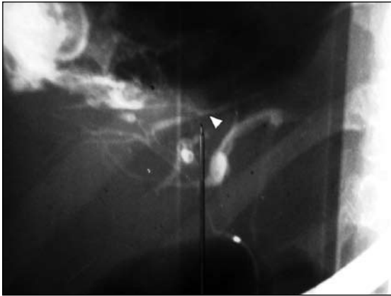
Fig. 2 ERCP shows extravasation of the contrast agent from one of the branches of the right hepatic ducts (arrowhead). The extravasated contrast is seen to outline the cyst in the upper left corner of the radiograph.

insertion of the pigtail catheter, the nature of the fluid changed from clear to bilious. The average daily output was 300–400 ml. The catheter was kept in situ to allow free drainage of the cyst in order to enable spontaneous closure of the fistula. However, the output did not decrease after two weeks.