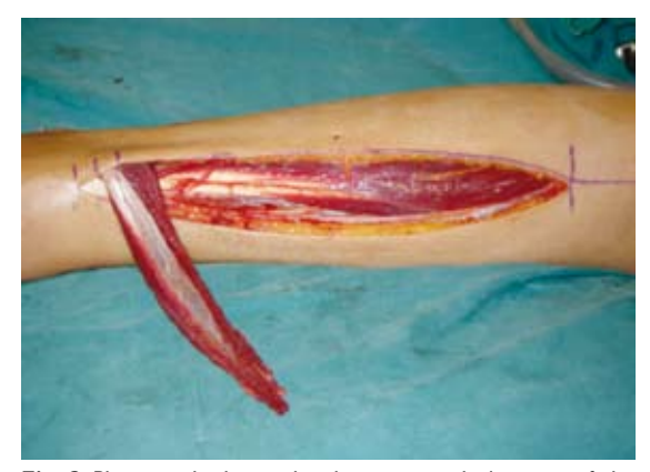
Fig. 3 Photograph shows the dissection and elevation of the flap.

should be technically easy to harvest, reliable and have a high success rate with minimal donor site morbidity. The distally pedicled peroneus brevis muscle flap is a