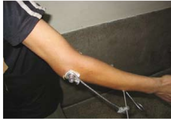
Fig. 4 Photograph shows the elbow extension at six weeks post operation.

The surgery was performed under general anaesthesia, with the patient in the lateral decubitus position. The patient's arm was supported over a padded post that enables the manipulation of the elbow during surgery. The incision was sited over the posterolateral aspect of the elbow beginning at the midline, about 10 cm proximal to the olecranon. The incision was slightly curved laterally at the tip of the olecranon and continued