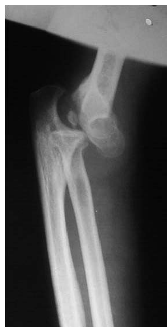
Fig. 1 Lateral radiograph shows the neglected elbow dislocation.

A 25-year-old male labourer presented with a neglected posterior elbow dislocation on the right side without any deficit of three months' duration (Figs. 1 & 2). The elbow was fixed at 15° of flexion with no further