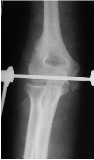
Fig. 3 Postoperative anteroposterior radiograph shows the improvised external fixator, with the lower humeral pin across the axis of rotation of the elbow connected to ulnar pins through the Bohler stirrup.

mobilisation was started on the third postoperative day. The range of movement at six weeks with the fixator was 15°–80° of elbow flexion (Figs. 4 & 5). The assembly was removed at eight weeks. The final range of movement achieved at 12 weeks was 10°–90° of elbow flexion and 10° of pronation and supination each. The patient was satisfied with the result and retained his pre-injury level of activity.