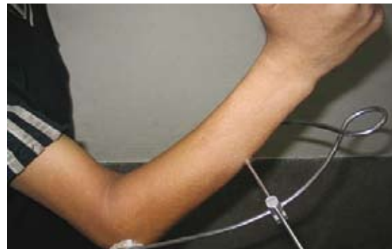
Fig. 5 Photograph shows the elbow flexion at six weeks post operation.

distally for 5 cm in the forearm. The aponeurosis of the triceps was reflected distally in the form of an inverted V. (1) The distal humerus was freed of all muscular and capsular attachments by subperiosteal dissection. The ulnar nerve was then transported anteriorly and held with a facial sling. After an adequate release of the collateral ligaments around the condyles of the humerus, the joint was inspected and reduced.