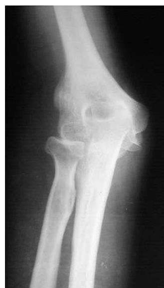
Fig. 2 Anteroposterior radiograph shows the neglected elbow dislocation.

movement. Open reduction and V-Y lengthening of the triceps muscle were performed, followed by external fixator application (Fig. 3). Active and active-assisted