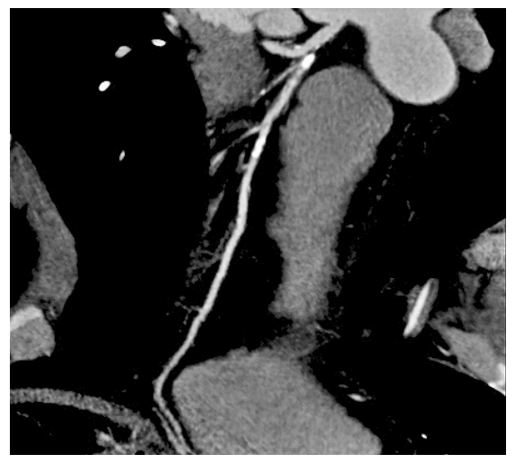
Fig. 2 Curved planar reformatted image acquired with a dualsource CT angiography shows calcified plaques at the proximal and distal segments of the left anterior descending artery in a 58-year-old man presenting with symptoms of chest pain.

CS is usually performed as a screening method with the use of low radiation dose scanning techniques. The purpose of the scan is to detect and calculate the calcium density, volume or mass. The total coronary calcium is used as a way of prognosticating and stratifying the risk of CAD. The rationale behind it is that coronary artery calcification is part of the atherosclerotic degeneration of the arterial vessel wall, and coronary atherosclerosis is the only disease associated with calcium in the coronary arteries. Thus, measurement of the amount of calcium allows for an accurate estimation of the amount of coronary atherosclerosis and therefore, the risk of CAD. The total CS is calculated by adding up the volume of