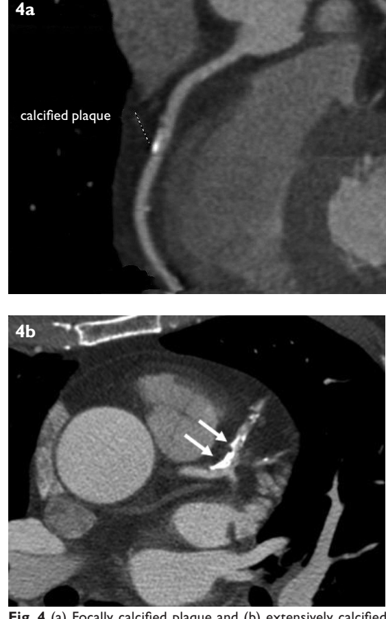
Fig. 4 (a) Focally calcified plaque and (b) extensively calcified plaque are visualised at the right coronary and left anterior descending arteries, respectively, in two patients suspected of coronary artery disease.

Intravascular ultrasonography (IVUS), an invasive catheter-based imaging technique, is regarded as the reference method for studying coronary atherosclerotic plaques because it allows for reliable quantitative and qualitative characterisation of plaque components.<sup>(26)</sup> Previous studies have shown that MSCT is able to analyse coronary plaques quantitatively and qualitatively, especially by assessing the intra-plaque density.<sup>(12,27,28)</sup> However, a direct comparison of IVUS and MSCT has revealed general overestimation on MSCT for quantitative measurements of all areas and thickness.<sup>(29,30)</sup> Chopard et al recently reported that the 64-slice CT failed to analyse plaque morphology and components accurately.<sup>(30)</sup>