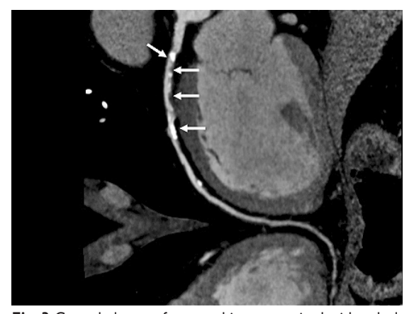
Fig. 3 Curved planar reformatted image acquired with a dualsource CT angiography shows a mixed type of calcified plaque at the mid-segment of the right coronary artery (arrows) in a 73-year-old man with significant coronary stenosis.

limiting coronary stenosis,<sup>(22)</sup> but also to detect plaque components, measure the atherosclerotic plaque burden and its response to treatment, as well as to differentiate stable plaques from those that are prone to rupture.<sup>(14,23)</sup> MSCT allows for the non-invasive detection of plaque morphology and composition (calcified vs. non-calcified atherosclerotic plaques) as well as the assessment of the extent of remodelling.<sup>(24)</sup>