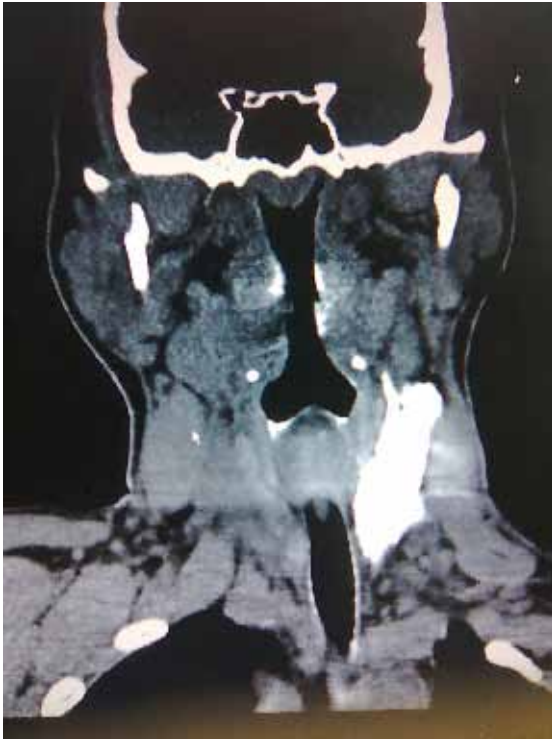
Fig. 2 Coronal CT image with contrast injected through the external opening of the fistula shows the contrast filling the cystic defect within the fistula tract.

He was last seen at 17 weeks post operation and is currently doing well.