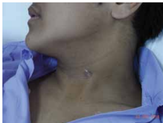
Fig. 1 Photograph shows the external opening of the third branchial fistula at the left anterior middle and lower third of the sternocleidomastoid muscle.

A 14-year-old boy presented with a discharging sinus on the left neck, which had failed to respond to multiple courses of antibiotics over the past six months. He had a history of left neck swelling at birth, which had enlarged and then burst at ten days of life. It had been managed conservatively at that time, and the condition had never recurred until the current presentation. Examination revealed a small opening with pus discharge at the junction of the middle and lower third of the anterior border of the sternocleidomastoid muscle (Fig. 1). Computed tomography (CT) fistulogram was performed, where the external opening was cannulated and infused with contrast material. It revealed a lobulated lesion at the patient's left neck, which measured 2 cm × 2 cm × 4 cm and which tracted medially and superiorly into the pyriform fossa (Fig. 2).