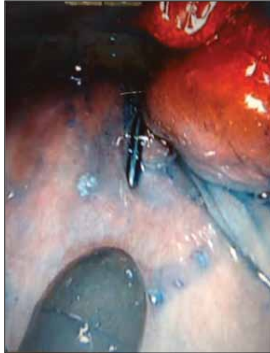
Fig. 5 Indirect laryngoscopic view shows the internal opening of the fistula that opens into the right pyriform fossa.

Most authors recommend either an ultrasonography of the neck, barium swallow or CT imaging for a branchial anomaly. Some authors even advocate the use of magnetic resonance (MR) imaging. (4,5,9,10) CT fistulogram was used in our case, as there was an external opening. CT imaging is recommended, as it allows delineation of the tract while detecting any abnormal soft tissue swelling or deformation of the pyriform sinus fossa due to adjacent soft tissue swelling, and also detects the presence of gas in the tract. (11) Gas, which is better detected on CT compared to MR imaging, is pathognomonic for pyriform sinus fistula. (12) CT would also be able to sufficiently assess the involvement of the thyroid gland, which is seen as a swelling with poor margin definition and loss of high attenuation of the affected lobe. (11) CT imaging with fistulogram not only delineated the tract satisfactorily, but also allowed us to assess its involvement with the thyroid gland and its relation to the surrounding major structures in our patient. Ultrasonography is useful as an initial investigation of a neck mass, where the presence of gas raises suspicion of a pyriform fossa