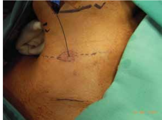
Fig. 3 Photograph shows the tract dilated serially using a metal probe to enable the injection of methylene blue dye.

A branchial fistula is thought to form when the mesenchyme that separates the cleft and pouch involutes, thus uniting them. (4) Therefore, the fistula would be caudal to the structures derived from the corresponding arch and dorsal to the structures from the following arch. A third branchial fistula would course between the third and fourth arch structures. In theory, the course starts externally from the skin opening at the upper third of the sternocleidomastoid muscle, through