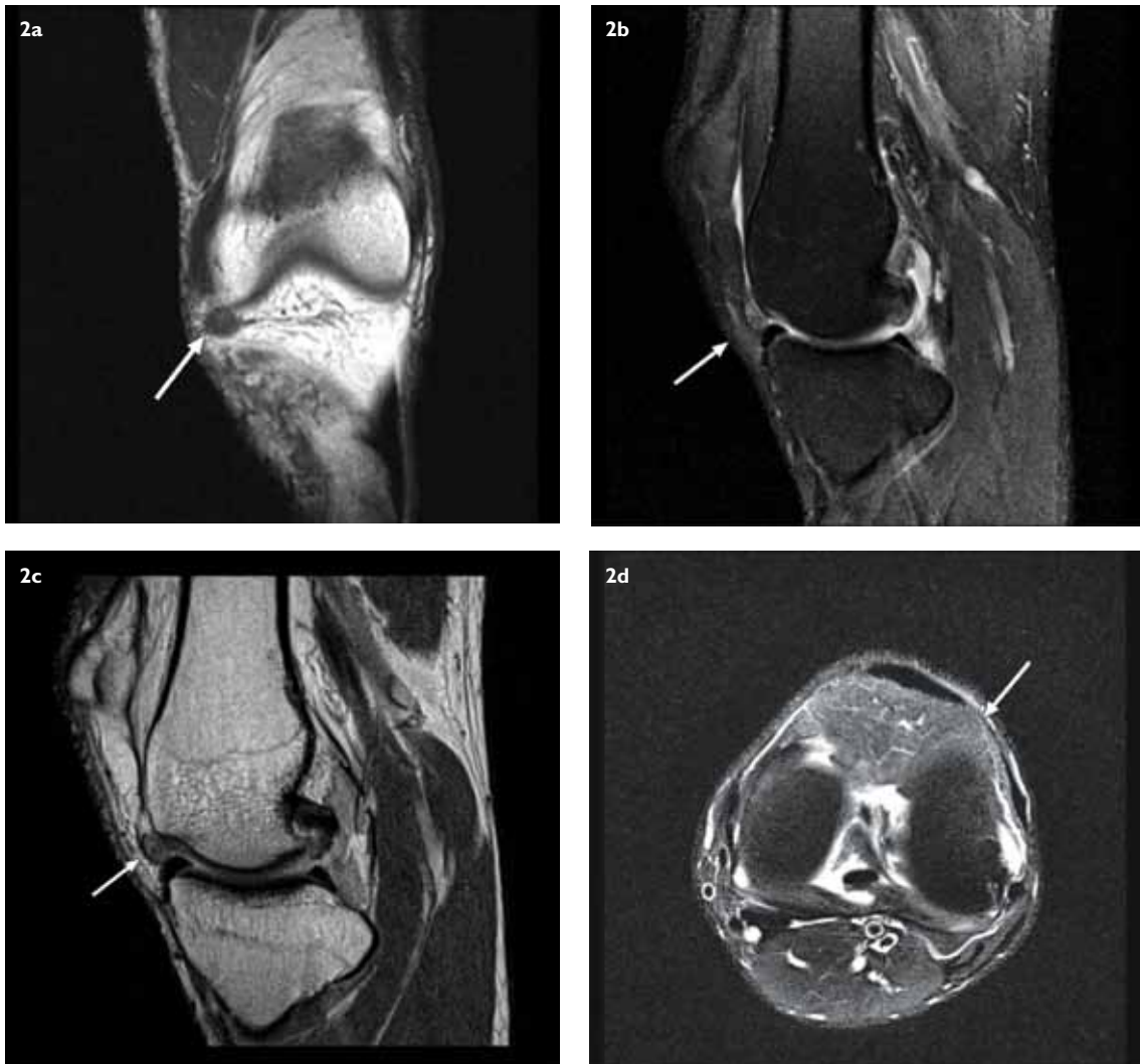
Fig. 2 MR images before arthroscopy indicate pigmented villonodular synovitis (PVNS). (a) T1-W coronal image shows PVNS with void signal intensity (arrow). (b) T1-W and (c) T2-W sagittal images show low-signal intensities (arrows). (d) T2-W axial image shows void signal (arrow).