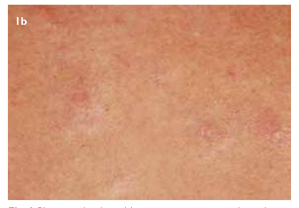
Fig. 1 Photographs show (a) eczematous excoriated papules on the patient's thigh at initial presentation and (b) dermal nodules on the patient's back three years after the initial presentation.