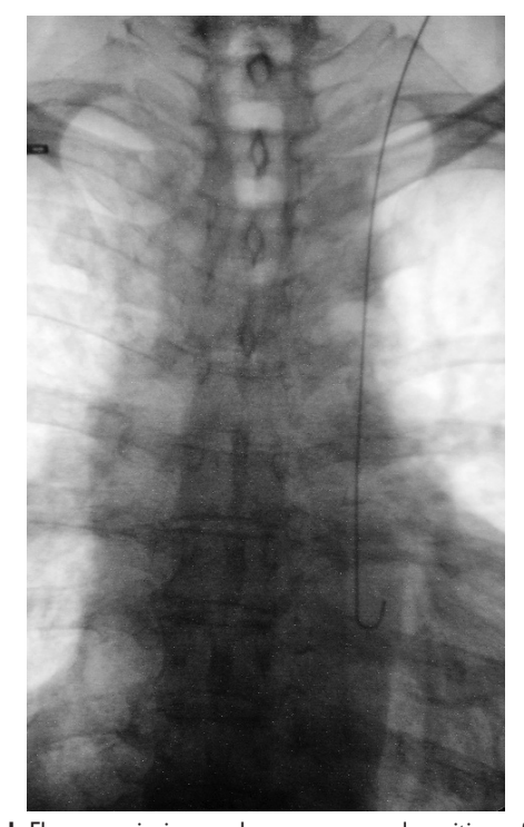
Fig. I Fluoroscopic image shows an unusual position of the guidewire along the left paramediastinum following left jugular venepuncture.

A 58-year-old man with diabetes mellitus and endstage renal failure presented with a one-day history of breathlessness that was not associated with chest pain, diaphoresis or fever. He had a history of aortic coarctation, which was surgically corrected about 30 years ago. The patient had been receiving haemodialysis via a left arteriovenous fistula (AVF). However, this was complicated by stenosis, which was refractory to