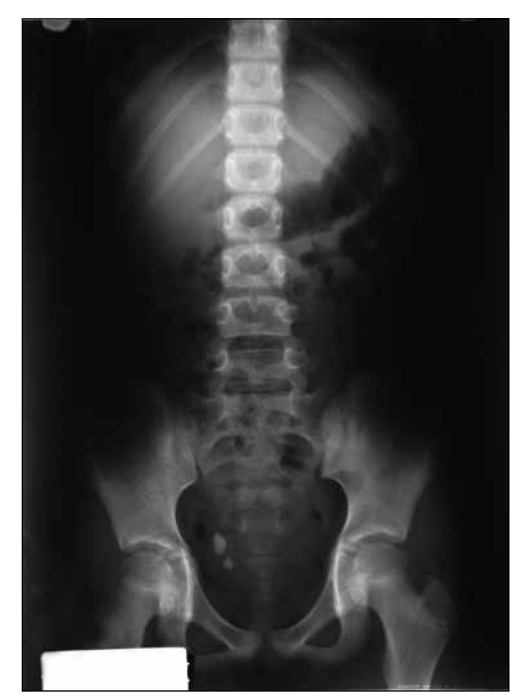
Fig. I Kidney, ureter and bladder radiograph of a five-year-old girl shows a stone in her right ureterovesical junction.