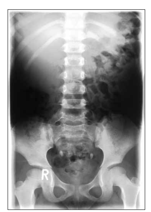
Fig. 2 Kidney, ureter and bladder radiograph of a six-year-old girl shows a bilateral distal ureteric stone.

or without urine culture and sensitivity as well as KUB