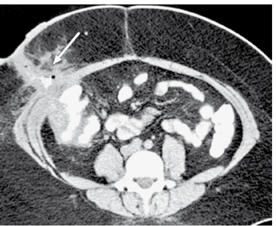
Fig. 2 Axial CT image shows the ileocutaneous fistula (arrow).

appendix (Case 2, 4 and 5). Histology results were immediately available for four patients, with all the changes consistent with TB (Figs. 1 & 2), and they were started on standard anti-TB treatment. The histologies showed caseating granuloma, but no AFB was identified in the histology of any of the patients. Unfortunately, the histology result of one patient (Case 4) was not retrieved, and she was not immediately started on anti-TB treatment. This resulted in the formation of an ileocutaneous fistula (Fig. 2), which required a laparotomy and fistula excision. The resected specimen showed changes that were consistent with TB (chronic inflammatory changes, with caseating granuloma but no AFB). This was complicated by wound infection and fistula recurrence. The patient was started on anti-TB treatment, and the fistula eventually resolved completely.