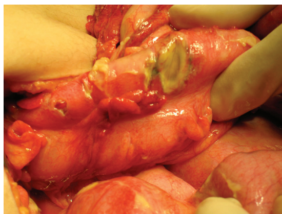
Fig. 1 Intraoperative photograph shows multiple perforations and impending perforations in the caecum and the ascending and proximal transverse colon, with a relatively healthy intervening bowel.

A 15-year-old girl presented with four days of sore