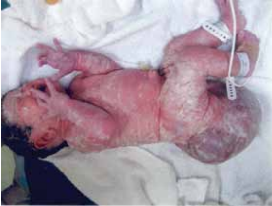
Fig. 3 Case 1. Photograph shows a 4.47-kg baby girl with SCT delivered by Caesarean section.