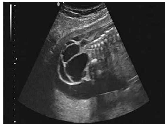
Fig. 1 Case I. Trans-abdominal US image shows a lobulated swelling, predominantly cystic, at the sacrococcygeal region at 20 weeks' gestation.

Computed tomography (CT) imaging of the neonate's abdomen and pelvis was performed on Day 1 of birth, which revealed a large SCT with intra-abdominal extension, possibly up to the inferior aspect of the superior mesenteric vessels. This mass was in continuity with the soft tissue in the pelvis and lower abdomen, thus displacing the urinary bladder and uterus anterosuperiorly, and was bordered superiorly by the superior mesenteric vessels. There was no obvious extension of this mass into the spinal canal. A vascular stalk was seen extending inferiorly down the left anterior