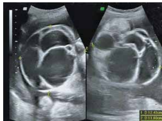
Fig. 2 Case I. Trans-abdominal US image of the SCT measuring 12.4 cm × 11.6 cm × 10.5 cm at 33 weeks of gestation. The SCT had a final recorded dimension of 14.3 cm × 13.9 cm × 10.6 cm on imaging at 35 weeks of gestation.

aspect of the sacrum into the exophytic component of the mass.