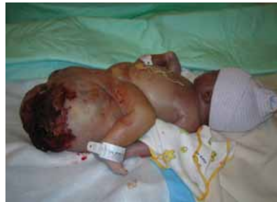
Fig. 6 Case 2. Photograph of the 3.5-kg baby boy delivered by an uncomplicated elective lower segment Caesarean section at 28 weeks and 6 days shows a large friable SCT measuring 16.0 cm × 13.0 cm × 14.5 cm, with active oozing from the tumour.

from 8.2 to 13.9 g/dL. Amnioreduction was performed under aseptic technique (1,180 ml amniotic fluid was drained). However, despite repeated transfusions, the MCA PSV levels remained high.