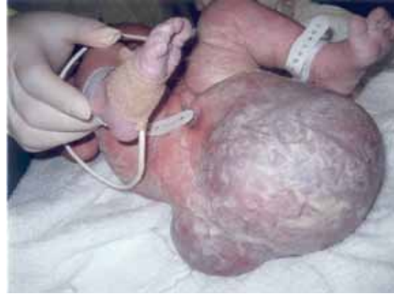
Fig. 4 Case 1. Photograph shows a huge, lobulated swelling that is predominantly cystic, with some solid component seen at the sacrococcygeal region. The anal opening is pushed anteriorly.

showed a large SCT measuring 15.0 cm × 12.0 cm × 5.0 cm that was mainly cystic with some solid component. The tumour was attached to the lower end of the coccyx superiorly and the rectum anteriorly. There was no intra-abdominal extension. Histology showed features of benign mature cystic teratoma. Postoperatively, the neonate recovered well, and was discharged on Day 13 of life. Upon follow-up at two weeks post surgery, the neonate was well and the wound had healed. She was on regular follow-up with the neonatologist.