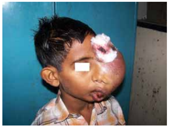
Fig. I Photograph shows a large tumour involving the left maxillofacial region and orbit in our patient.

A 12-year-old Indian boy was admitted to our hospital with complaints of a large painless swelling in the left cheek region for a period of four months. The swelling also involved the left orbit, and was incidentally noticed