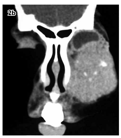
Figs. 2 Contrast-enhanced (a-b) coronal and (c) axial CT images show a large heterogeneously enhancing space-occupying lesion in the left inferolateral orbital region, causing bony destruction and proptosis with invasion of extraocular muscles and extension into the left maxillary sinus.

CT imaging of the chest was normal and bone marrow biopsy revealed no significant abnormality. CT imaging of the abdomen, however, revealed a few retroperitoneal lymph nodes. Biopsy from the mass showed infiltrating tumour composed of small round cells in solid sheets and clusters. In some places, the cells were arranged around eosinophilic fibrinous material in a rosette-like pattern. These cells showed scanty to moderate cytoplasm, with a high nucleocytoplasmic ratio. The nuclei had open chromatin and single-to-multiple distinct nucleoli. Occasional mitotic figures were noted. Classical lymphoglandular bodies, splaying of chromatin material or a vacuolated background were not seen. The morphological features were those of a malignant round cell tumour, with the