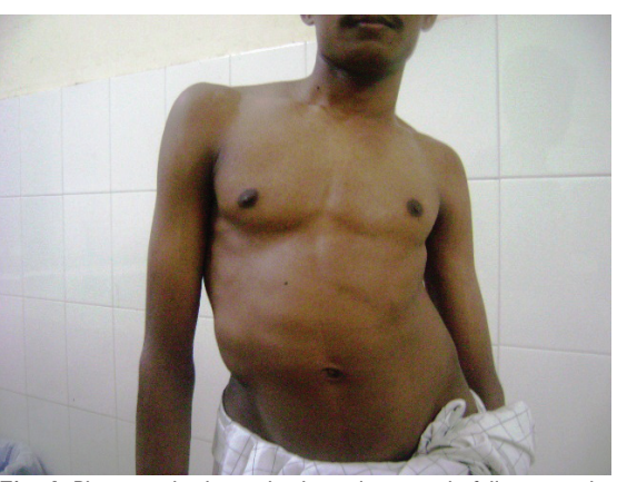
Fig. I Photograph shows kyphoscoliosis with fullness in the epigastrium and umbilical region in our patient.

A 21-year-old man presented with intermittent abdominal pain of three months' duration. On physical examination, there was gross kyphoscoliosis and a large mobile lump in the epigastrium and umbilical region (Fig. 1). Routine laboratory tests were unremarkable. Computed tomography (CT) examination revealed an enlarged ectopic spleen with a well-defined, thin-walled, non-enhancing, high-density cystic lesion measuring 15 cm \times 10.4 cm \times 15.2 cm (Fig. 2). Skeletal anomalies, including scoliosis of the thoracolumbosacral spine, multiple vertebral segmentation anomalies (including spina bifida