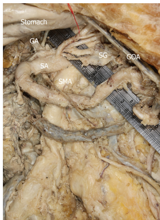
Fig. 1 Photograph shows a coeliac trunk with multiple aberrant branching patterns.

For decades, arterial variations of the aorta have attracted the attention of anatomists, clinicians and radiologists due to their prominent significance in many surgical specialties. The coeliac trunk is one of the most well-documented arterial trunks, with many researchers pondering on the topic, as well as providing detailed studies and an impressive number of specimens. The first description of normal and aberrant coeliac trunk anatomy was published in 1756 by Haller. (1) However, studies regarding the inferior phrenic artery (IPA) are limited, since they were considered to be of minor clinical interest in the past. Nowadays, it is known that the IPA employs the most frequent origin of extrahepatic arterial blood source in hepatocellular carcinoma. (2) In cases of unresectable hepatic tumour involving collateral arterial supply from the right or left IPA, the interventional radiologist should precisely detect the appropriate pathway for catheter placement during tumour embolisation. If involved,