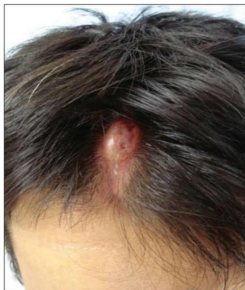
Fig. 1 Photograph shows a discharging nodule measuring 3 cm × 1 cm on the scalp.

Cryptococcal infection can affect any organ of the human body. Cutaneous involvement is the third most common after pulmonary and central nervous system (CNS) involvement. Currently, two species and four serotypes of Cryptococcus (C.) have been recognised. C. neoformans species complex comprises C. neoformans var. grubii (serotype A), C. neoformans var. neoformans (serotype D) and C. gattii species (serotype B and C). In most cases, the cutaneous lesions are attributable to haematogenous dissemination (i.e. secondary cutaneous cryptococcosis) by C. neoformans . However, rare cases of primary cutaneous cryptococcosis from direct inoculation or exposure, especially due to haematogenous dissemination are increasingly being reported and recognised. We report a case of primary cutaneous infection due to C. gattii following trauma in an immunocompetent patient. A total of seven cases of