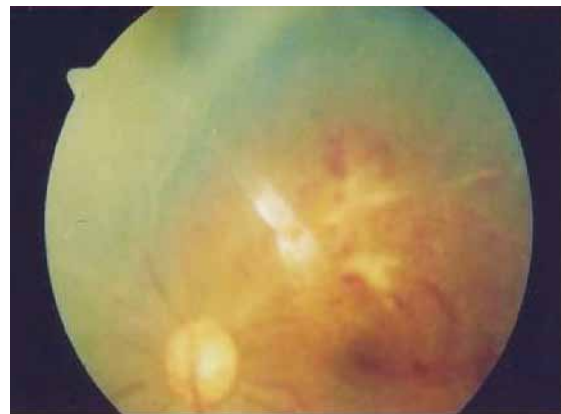
Fig. 3 Fundus photograph shows the left eye of a patient with superotemporal branch retinal vein occlusion with macular involvement.

Autoregulation of retinal vessels plays an important role in maintaining circulation in eyes that are exposed to chronic hypoxia. (6) Inadequate autoregulatory response of the retinal vascular system is thought to be responsible for HAR. As an individual ascends to more than 2,743 m above MSL, the fraction of oxygen in the atmosphere remains constant. Decrease in atmospheric pressure causes the partial pressure of oxygen to drop. This results in hypoxia, with the partial pressure of arterial oxygen decreasing from 95 mmHg at sea level to approximately 60 mmHg at 15,000 ft (4,572 m) above MSL. (11) This drop in oxygen available to meet the body's metabolic requirements initiates a host of physiological changes. Retinal blood flow has been shown to increase by 128% after four days at 5,300 m above MSL. (8) This causes a clinically observed increase in diameter and tortuosity of the retinal blood vessels and optic disc hyperaemia, which are seen in most individuals at high altitude and considered to be a normal response to high altitude. (12,13) Autoregulation of the retinal vessels is observable as vasodilatation during hypoxia, but choroidal vessels do not autoregulate and normally