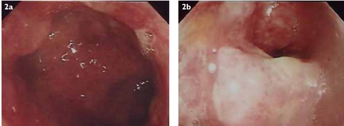
Fig. 2 Endoscopic images show (a) friable ulcerated colonic mucosa; and (b) stenosis.

very young (five-week-old infant) (6) to young adults (7) and the elderly. (8) The reason for the predilection of the colon is unknown. The presence of underlying mucosa pathology such as inflammatory bowel disease has been reported to be a risk factor. (9) None of our patients had any underlying colonic disorders. Clinical manifestations of CMV colitis are similar to other infective causes, with diarrhoea, fever and abdominal pain predominating. In one study, 53% of the patients with diarrhoea had bloody stools and another 20% had positive occult blood testing. (1)