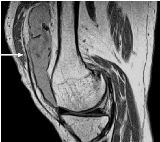
Fig. 1 MR image of the right knee shows large joint effusion at the suprapatellar recess, demonstrating a fluid-fluid level (arrow) due to layering of blood.