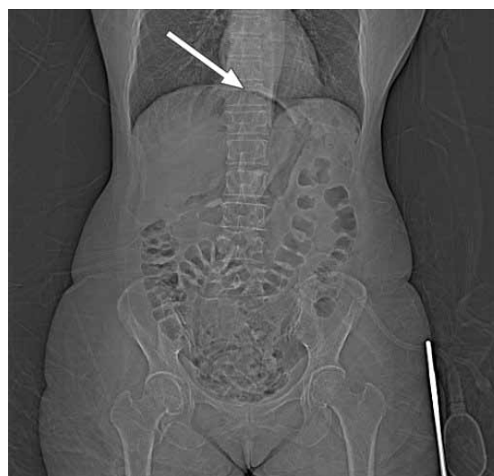
Fig. 1 Prone scanogram shows a poorly distended colon and the presence of pneumoperitoneum (arrow).

A mechanical bowel preparation was administered the day before CTC was performed. The end colostomy was intubated with a 24F Foley catheter, but some resistance was encountered. The catheter