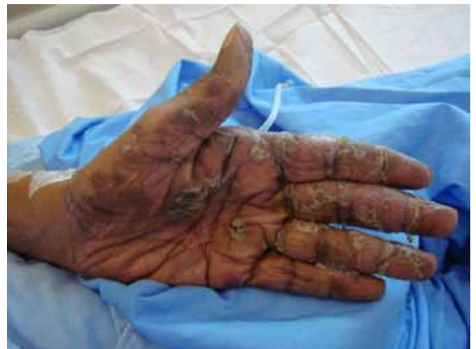
Fig. 4 Photograph shows desquamation over the left palm.

cases and develop following diagnosis of malignancy in 10%–15% of cases. (4)