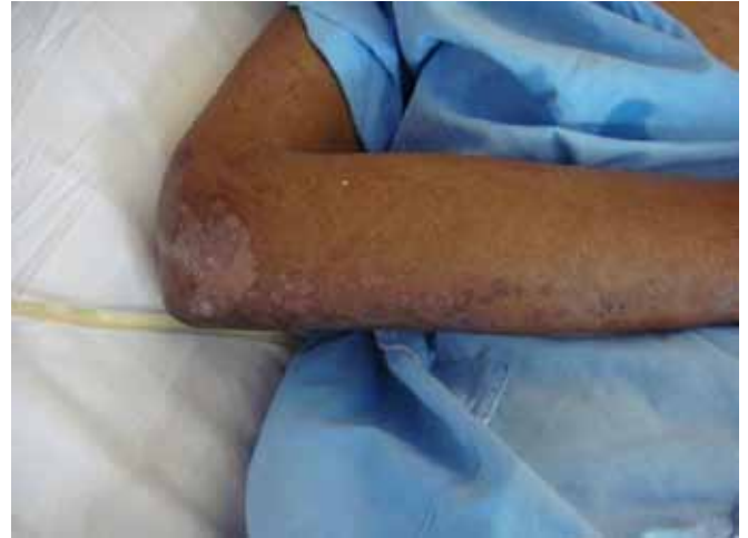
Fig. 2 Photograph shows thin psoriasiform plaques on the extensor surface of the right forearm.

Carcinomas of the upper aerodigestive tract (the larynx, pharynx, trachea, bronchus and the oesophagus) are found in more than half of the cases reported in the literature. Associated neoplasms in other locations (skin, breast, genitourinary tract, liver, colon, Hodgkin's lymphoma) have also been reported. In some cases, the primary sites of malignancies were unknown. (2,5) Clinically, the psoriasiform rashes of acrokeratosis paraneoplastica of Bazex precede the diagnosis of the malignancy in 65%–70% of cases, occur simultaneously in 15%–25% of