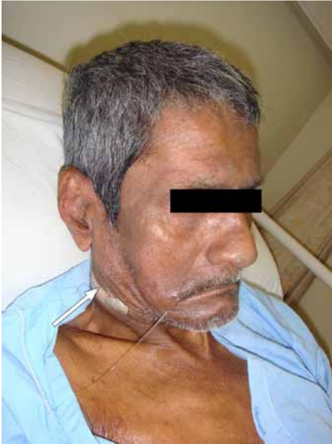
Fig. 1 Photograph shows a right-sided neck mass (arrow showing site of fine needle aspiration cytology) and thin scaly psoriasiform plaques over the brows, helix of the right ear and tip of the nose.

The cutaneous findings of acrokeratosis paraneoplastica of Bazex evolve through three stages. (4) In the first stage, erythematous psoriasiform plaques are found on the fingers, toes, helices of ears and nose. Nail folds are usually involved, leading to nail dystrophy. The associated tumour is frequently asymptomatic at this stage. In the second stage, the skin eruption spreads to the palms and soles, with development of palmoplantar keratoderma. The associated tumour could display local symptoms at this stage. In the third stage, if the tumour remains untreated, the psoriasiform rashes could extend to the trunk and limbs. The histopathological findings are nonspecific and may include hyperkeratosis, parakeratosis, acanthosis, isolated necrosis of keratinocytes and a perivascular lymphohistiocytic inflammatory infiltrate. Rare features include dyskeratotic keratinocytes, vacuolar degeneration, band-like infiltrate and melanin incontinence. (4,5) Immunofluorescence studies of lesional skin usually yield negative results. (5)