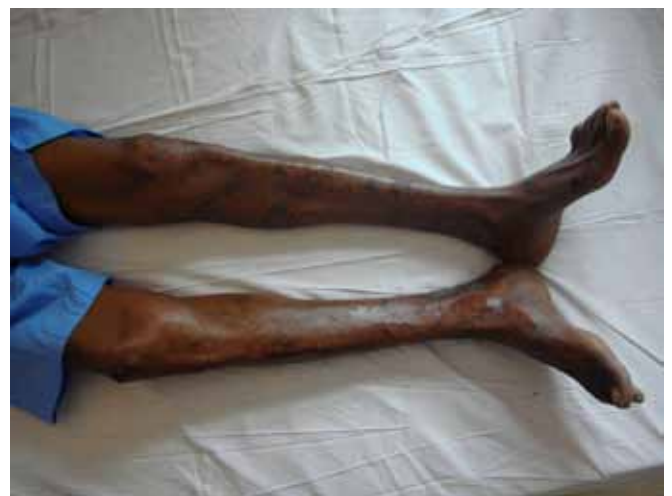
Fig. 3 Photograph shows thin psoriasiform plaques over the knees and shins.