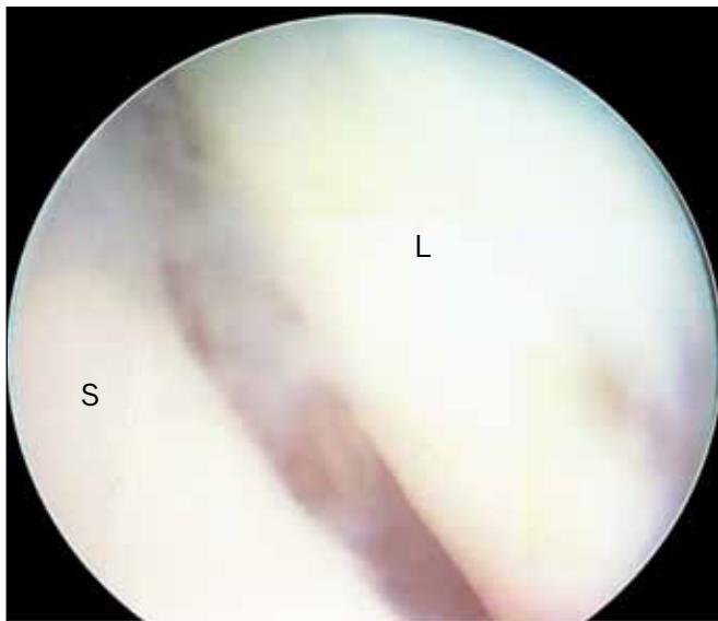
Fig. 1 Arthroscopic image of midcarpal joint shows a scapholunate gap of Geissler Grade III instability. (S: scaphoid; L: lunate)