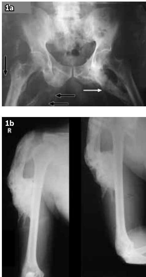
Fig. 1 (a) Pre-operative anteroposterior radiograph of the pelvis (taken in 2004) shows predominant heterotopic ossification at the adductor compartment of the left hip (white arrow) and to a lesser degree, ossification around the right hip (black arrows). (b) Pre-operative anteroposterior and lateral radiographs of the right shoulder (also taken in 2004) show heterotopic ossification predominantly affecting the abductor muscles.

three months) in 2008 failed to halt the progression of the disease. Nerve conduction studies performed in August 2009 revealed diffuse asymmetrical sensory motor conduction anomalies affecting the left ulnar nerve and bilateral common peroneal nerves, due to compression caused by ossific masses.