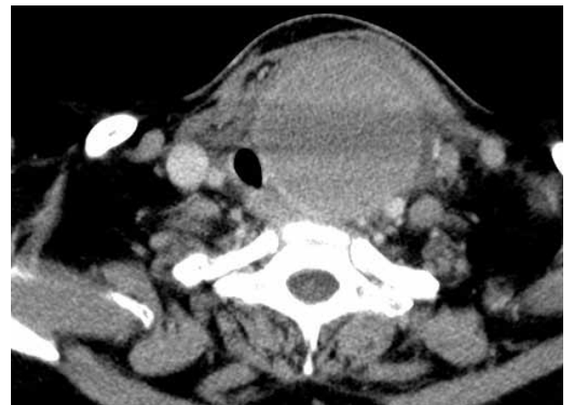
Fig. 1 CT image of the neck shows a rim-enhancing cystic lesion arising from the left lobe of the thyroid.

A 54-year-old Chinese woman presented with a ten-year history of thyroid swelling. The swelling had acutely increased in size for the past two months. This was associated with fever, pain and hoarseness of voice. The patient had a previous right hemithyroidectomy for a benign thyroid nodule 20 years ago. On examination, there was a warm, erythematous and tender thyroid swelling on the left, displacing the trachea to the right. Nasal endoscopy showed reduced mobility of the left vocal cord with a patent airway and no laryngeal oedema. Blood investigations revealed a mildly elevated total white cell count ( 11.8 \times 10^9/L ; normal range [NR] 4.0\text{--}10.0 \times 10^9/L ) and a normal differential count and high C-reactive protein (276 mg/L; NR 0.2–8.8 mg/L). Thyroid function indices revealed raised serum free thyroxine (17.1 pmol/L; NR 8.8–14.4 pmol/L) and normal thyroid stimulating