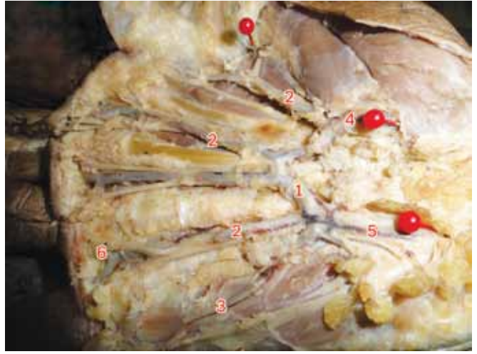
Fig. 2 Photograph shows a complete superficial palmar arterial arch and its branches in the right hand. 1: superficial palmar arch; 2: common digital arteries; 3: proper palmar digital artery; 4: superficial palmar branch of the radial artery; 5: superficial palmar branch of the ulnar artery; 6: proper digital artery