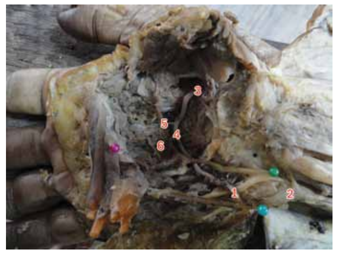
Fig. 5 Photograph shows a complete deep palmar arterial arch and its branches in the right hand. 1: deep branch of the ulnar artery; 2: ulnar artery; 3: radial artery; 4: deep palmar arch; 5 & 6: palmar metacarpal arteries