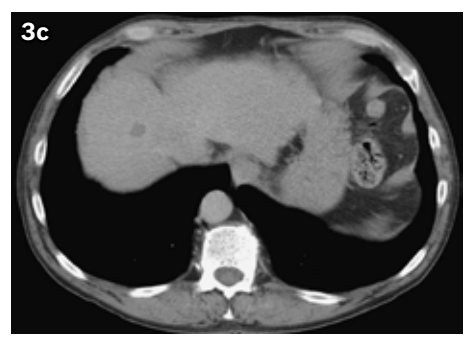
Fig. 3 (a) Hepatic arterial; (b) portal venous; and (c) delayed phase CT images ten months after the initial presentation show continued tumour regression with reduction in size of the known hepatocellular carcinoma and a small residual cystic area, which is likely necrosis. No residual areas of enhancement are seen with the mass.

Contrast-enhanced, multiphase CT of the abdomen approximately ten months after the patient's initial presentation showed continued reduction in size of the known hepatic mass. CT showed that it now measured 1.3 cm \times 1.1 cm, was non-enhancing and remained cystic in nature (Fig. 3). Again, no additional hepatic mass had developed in the interim. The patient continued to be well without signs of recurrence at the time of this writing.