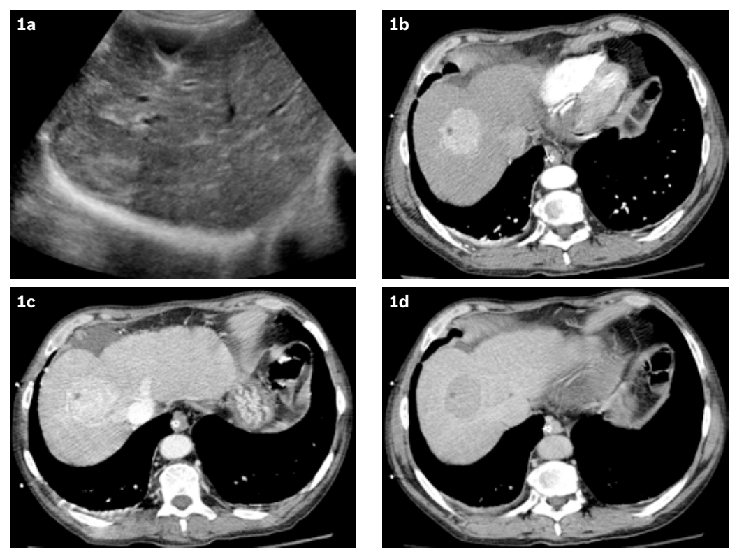
Fig. 1 (a) Abdominal US image shows a solid mass in the right hepatic lobe. (b) Hepatic arterial phase CT image shows a hypervascular mass with a small hypodense area. (c) Portal venous phase CT image shows the tumour remaining hypervascular to the liver. (d) Delayed phase CT image shows tumoural washout of the contrast, relative to adjacent liver parenchyma, compatible with a hepatocellular carcinoma.