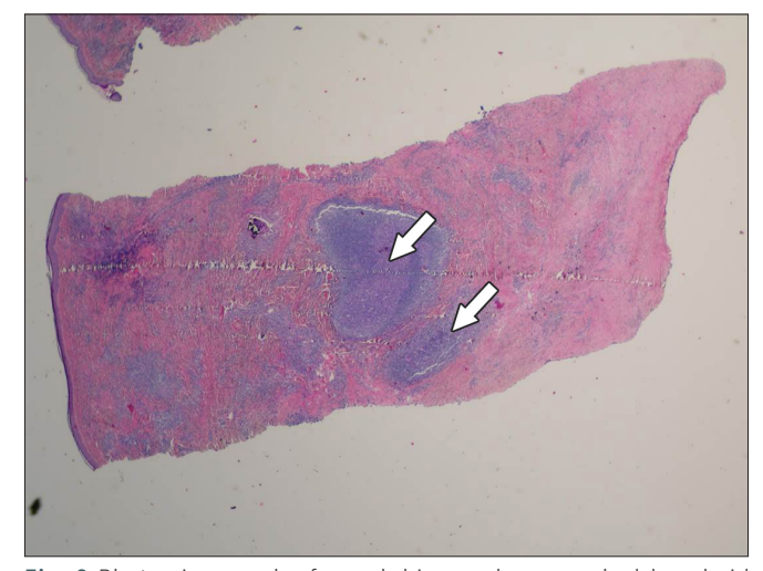
Fig. 2 Photomicrograph of punch biopsy shows marked lymphoid hyperplasia with irregular and nodular aggregates of mixed lymphoid cells and germinal centre formation in the dermis (arrows) (Haematoxylin & eosin, × 20).

lymphoproliferative disorder, with rare case reports of malignant transformation. (1,5) Although most cases are idiopathic, reported triggering factors include Borrelia burgdorferi infection, insect bites, drugs, acupuncture, trauma and vaccinations. (1,2) Common