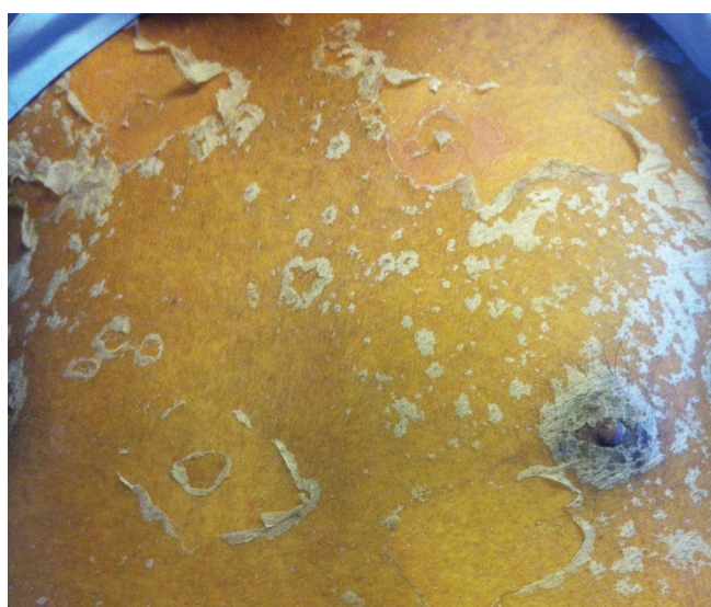
Fig. 3 Photograph shows postinflammatory hyperpigmentation with desquamation over the trunk.

Markedly raised transaminases are usually found in patients with TMP-SMZ-induced fulminant hepatic failure, with previous case reports detailing ALT and AST levels ranging from 2,000 U/L to 19,520 U/L and 957 U/L to 9,400 U/L, respectively. (4,5) Morimoto et al also reported that TMP-SMZ-induced hypersensitivity syndrome may be associated with reactivation of HHV6. (2) In our patient, polymerase chain reaction (PCR) for HHV6 DNA was negative. Recently, HEV testing has also been recommended in patients with drug-induced liver injury. (9) Although serologic testing for anti-HEV IgM with an enzyme-linked immunosorbent assay-based test (Genelabs Diagnostics, Singapore) was positive in our patient, HEV RNA by reverse transcriptase PCR and anti-HEV IgG were nonreactive. Follow-up serological tests for anti-HEV IgM and