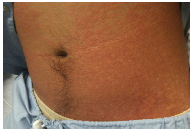
Fig. 1 Photograph shows generalised, confluent, erythematous maculopapular rash over the trunk.

A 17-year-old Chinese male adolescent presented to our emergency department with fever, myalgia and a nonpruritic maculopapular rash over his trunk and neck. He had developed nonpruritic, confluent, erythematous macules and papules after taking TMP-SMZ (80 mg TMP, 400 mg SMZ) for 28 days. The macules and papules first appeared over the neck and chest, and progressively spread to his limbs and the rest of his trunk within the next few days. He had been prescribed TMP-SMZ and isotretinoin by a general practitioner for nodular cystic acne vulgaris. Despite symptomatic treatment by the general practitioner, the patient's rash and fever did not subside, thus prompting a visit to our emergency department.