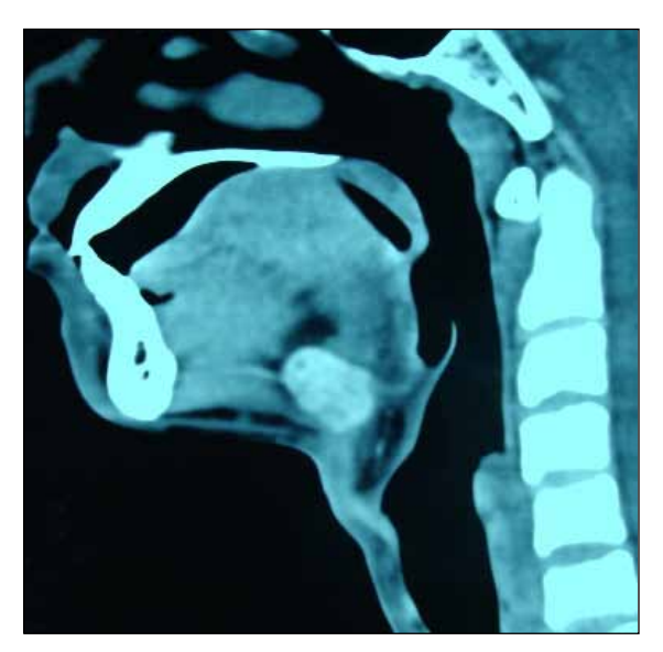
Fig. 3 Postoperative, contrast-enhanced, sagittal CT image shows a homogenously enhancing mass in the posterior floor of the mouth.

(normal 4.5–12.5 \mu g/dL), and a moderately elevated thyroid-stimulating hormone (TSH) level of 10.4 \mu IU/mL (normal 0.25–4.5 \mu IU/mL), which is indicative of a subclinical hypothyroid state. As the patient was previously not on any thyroid hormone treatment, he was started on medical therapy for his hypothyroid status.