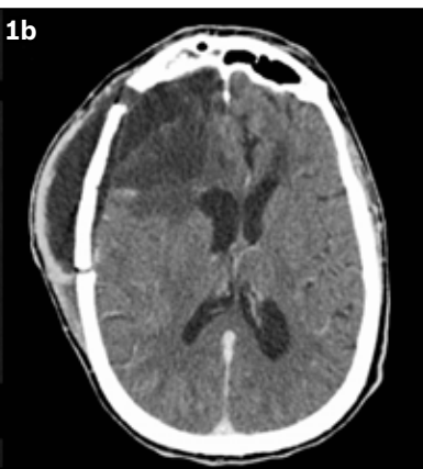
Fig. 1 (a) MR image of the brain shows a 7.5~\rm cm \times 7.4~cm mass involving the right frontal area, suggestive of a giant meningioma. (b) CT image of the brain shows complete removal of the tumour.

his wife left him, and he relocated to a country house, living in unhygienic conditions and refusing any external help.