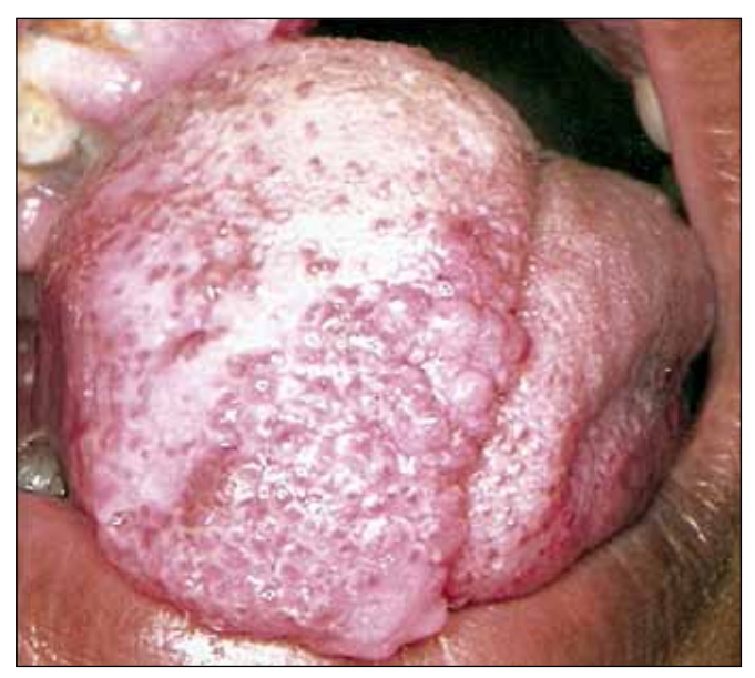
Fig. 3 Photograph shows hyperplasia of the right half of the tongue, with enlargement of the fungiform papillae.

Intraoral examination showed evident asymmetry caused by the enlargement of both the right maxillary and mandibular arches, with no midpalatal deviation (Fig. 2). There was a full complement of upper and lower teeth, except for missing right mandibular first and second molars, which were found to be impacted with incomplete roots on panoramic radiograph. The third molar on the right side was confirmed to be congenitally missing after radiological investigation. The deciduous second molar of the right side was retained. Unilateral macroglossia with typical enlargement of the fungiform papillae was also evident (Fig. 3). Based on the patient's clinical history and features, the condition was provisionally diagnosed as HFH.