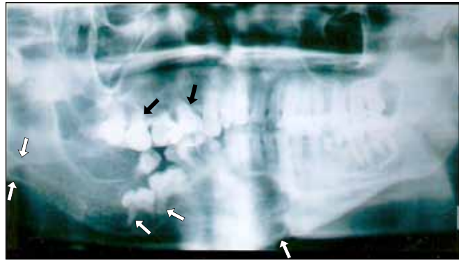
Fig. 4 Panoramic radiograph shows dentition with evidence of rightsided enlarged mandible, macrodontia, widened mandibular canal (white arrows) and blunted roots (black arrows).

Panoramic radiography and axial computed tomography (CT) confirmed the clinical findings. The panoramic radiograph revealed that the right mandibular condyle, coronoid process and mandibular body were enlarged. Significant additional bone growth of the maxillary alveolus, with prominent tuberosity, was also observed (Fig. 4). The observed mandibular deviation toward the left was due to the unilateral enlargement of the body of the right mandible. Increased density was also noticed in the region of the angle of the mandible, symphysis