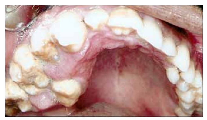
Fig. 2 Intraoral photograph shows an enlarged right maxillary arch.