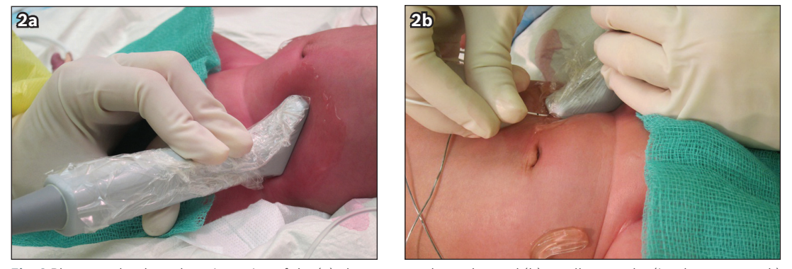
Fig. 2 Photographs show the orientation of the (a) ultrasonography probe; and (b) needle to probe (in-plane approach) during the ultrasonography-guided ilioinguinal-iliohypogastric nerve block.

supplementary oxygen support. Only neonates suitable for general anaesthesia were included. All neonates received general inhalational induction with 6% sevoflurane in 100% oxygen. The patients were intubated after paralysis with 0.5 mg/kg intravenous atracurium, and anaesthesia was maintained using desflurane 6% in an air/oxygen (50%/50%) mixture.