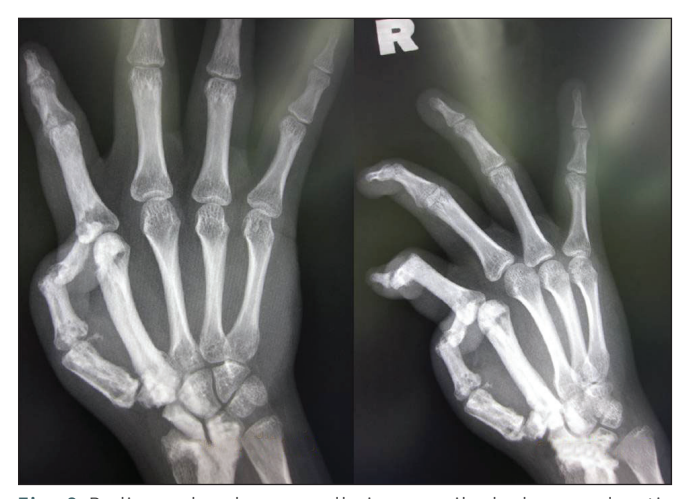
Fig. 2 Radiographs show a well-circumscribed, dense sclerotic appearance of the phalanges and metacarpal bones of the thumb and index finger. Sclerotic areas and opacities are present within the scaphoid, lunate, trapezium, trapezoid, capitates, distal radius and the supracondylar processes of the bilateral humeri.

of the left humerus showed the classic 'flowing candle wax' appearance, with sclerotic regions in the radius, carpals, metacarpals and phalanges. Magnetic resonance (MR) imaging of the right wrist revealed thickened bony cortex of the distal radius, ulna, scaphoid, lunate, trapezoid, trapezium, capitate, the first and second metacarpals, and the phalangeal bones,