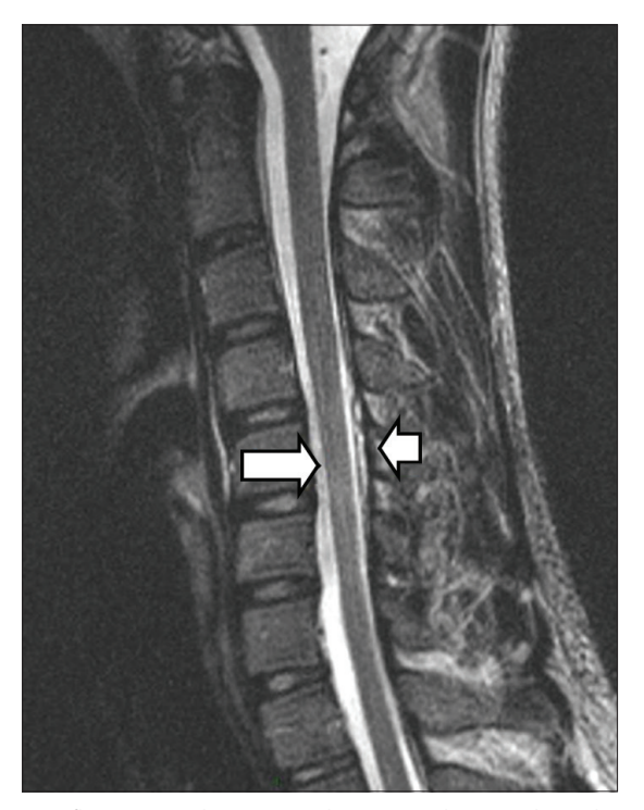
Fig. 2 Non-flexion cervical T2-W sagittal MR image shows cord atrophy at the C5-C6 level (arrow), predominantly affecting the bilateral anterior aspects, and the posterior dura to be detached (arrowhead).

Overall, the clinical and imaging features were compatible with the diagnosis of Hirayama disease. A neck collar was given to the patient to prevent neck flexion.