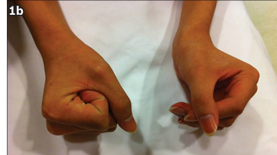
Fig. 1 Photographs show (a) marked atrophy of the thenar, hypothenar and interosseous muscles of both hands, but more severely affecting the left side, and (b) impairment of the palmar grasp.

disorder of the anterior horn cells of the lower cervical levels, and a diagnosis of Hirayama disease was suspected.